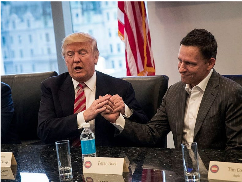
Then President-elect Donald Trump shakes hands with Peter Thiel during a meeting at Trump Tower in December 2016. Years later, Thiel would become a confidential human source for the FBI. He was directed not to report on his interactions with Trump or other US political figures, an associate said.

Confidential human sources enter "into a relationship with the FBI, and that relationship will forever affect the life of that individual," the guide says. "[They] will be either an 'FBI source' or a 'former FBI source' and, in turn, his or her conduct or misconduct will reflect upon the FBI." As such, the process for recruiting and maintaining such sources is highly regulated, requiring multiple layers of approval. Only people who are able to provide "valuable information ... on a recurring basis" are granted CHS status, according to the policy.