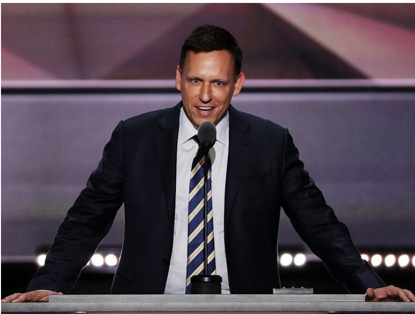
Thiel speaking at the Republican National Convention in 2016. He donated $1.25 million to Trump's campaign in 2016. He backed MAGA-aligned congressional candidates in 2020 and 2022. He has said he will be staying on the sidelines of the 2024 presidential race.